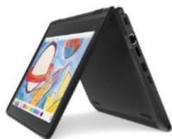
Lenovo ThinkPad 11e Yoga

In 2023, we will once again partner with EduNet to support the BYOD program. EduNet is an Authorized DET Supplier of digital technologies for Schools. Devices are delivered to the school, pre-loaded with all of the software that students need to be successful in their learning, including; software, network, internet and security settings.