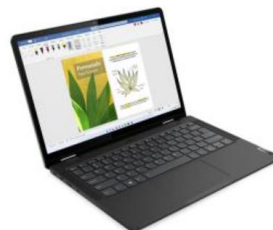
Lenovo 13w Yoga