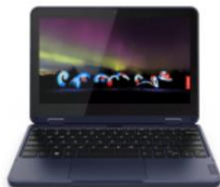
Lenovo 500w Yoga