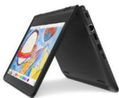
Lenovo ThinkPad 11e Yoga

In 2023, we will once again partner with EduNet to support the BYOD program. EduNet is an Authorized DET Supplier of digital technologies for Schools. Devices are delivered to the school, pre-loaded with all of the software that students need to be successful in their learning, including; software, network, internet and security settings.