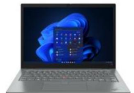
Lenovo ThinkPad L13 Yoga Gen3