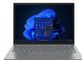
Lenovo ThinkPad L13 Yoga Gen3