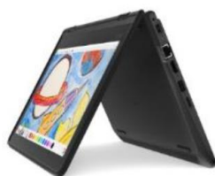
Lenovo ThinkPad 11e Yoga

In 2023, we will once again partner with EduNet to support the BYOD program. EduNet is an Authorized DET Supplier of digital technologies for Schools. Devices are delivered to the school, pre-loaded with all of the software that students need to be successful in their learning, including; software, network, internet and security settings.