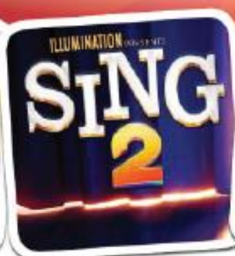
At the Movies