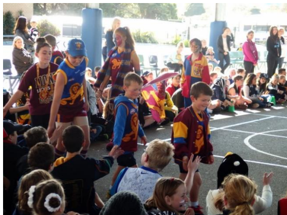
Traditional Footy Day celebration (gold coin donation)