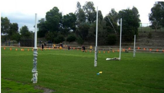
New turf for the goal square