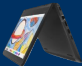
Lenovo ThinkPad 11e Yoga 5th Gen