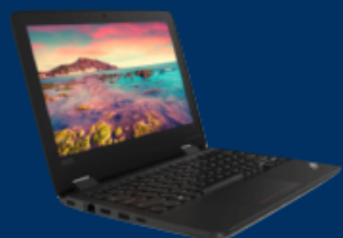
Lenovo ThinkPad 11e 5th Gen

As 2022 edges closer, we encourage families to purchase their child's device early to allow for current global delays. Students have experienced great success in using their devices to support their learning this year, let's keep up our outstanding results as we welcome year 2 students to the BYOD program.