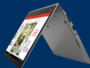
Lenovo ThinkPad L13 Yoga Gen 2