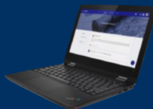
Lenovo ThinkPad 11e Yoga 6th Gen