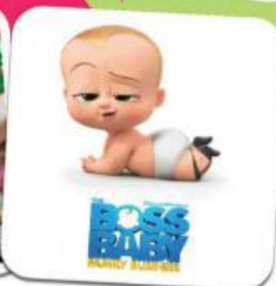
At the Movies