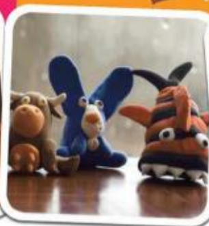
Aliens from Space