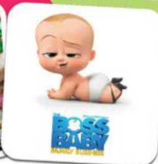
At the Movies