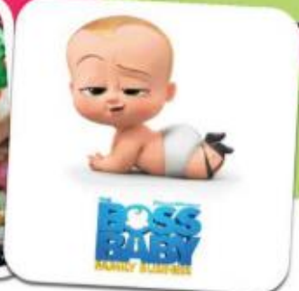
At the Movies