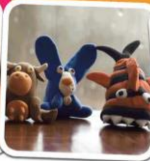
Aliens from Space