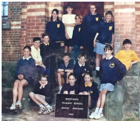
Right: House Captains.