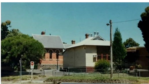
Left: the historic rural school building in the foreground (1916 Glenvale School building relocated to the school in 1948)