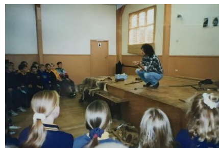
Right: school 'Incursion' using Christ Church Hall next door.