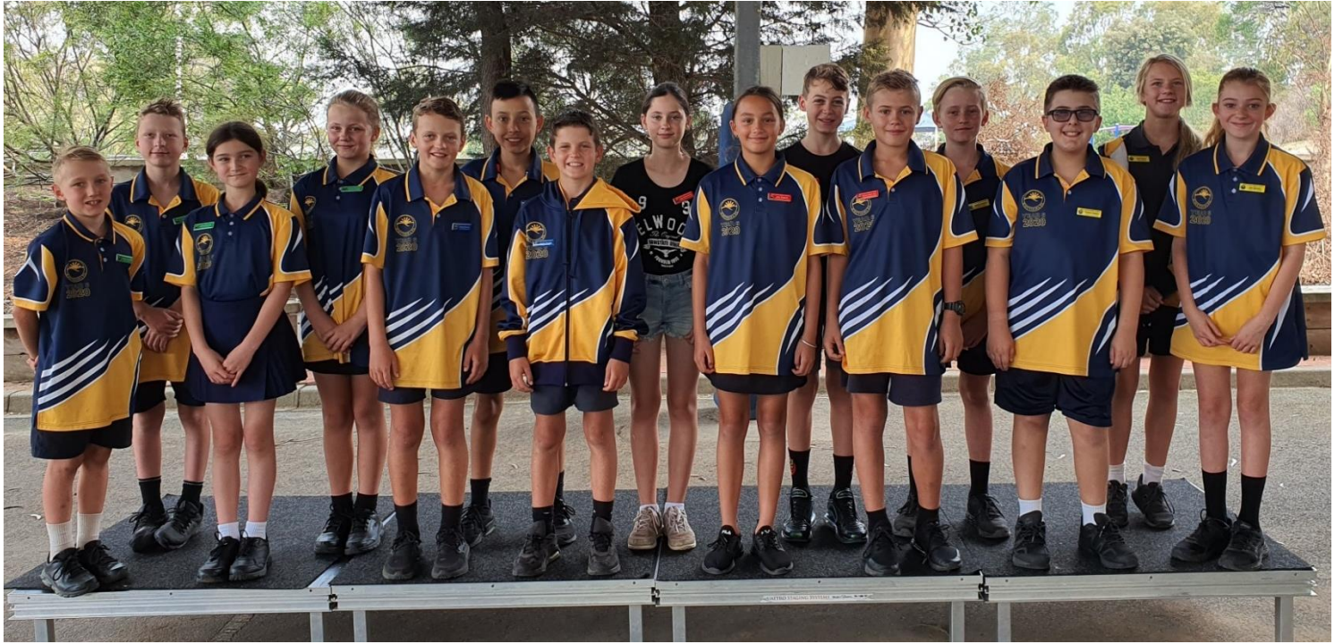
2020 House Captains