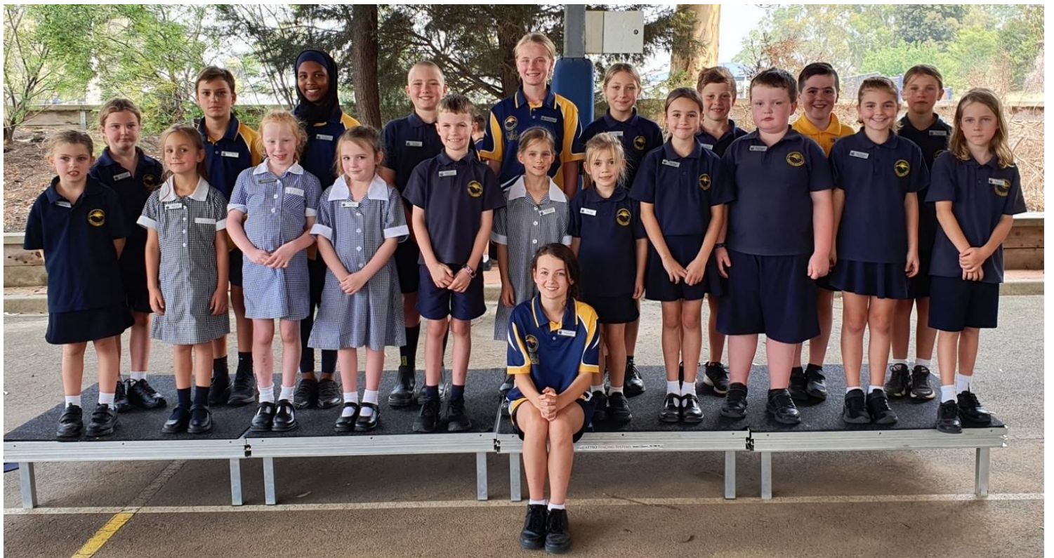
2020 Student Representative Council