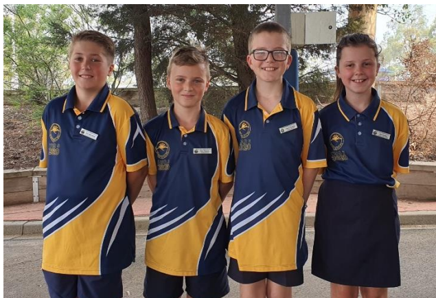
2020 School Captains

In addition to student leadership and agency, our school has a clear strategic focus for the year ahead. Our Annual Implementation Plan (AIP) for 2020 is due for presentation to school council next week. This document outlines the goals, targets, key improvement strategies and actions which will drive our work this year. Some key highlights of the plan include a formalised and expanded teaching coaching program across the school, a strong focus on literacy instruction through the implementation of a new reading model and the development of writing instruction. We are also introducing the 'Professional Learning Community' approach to our teams and will be undertaking formal training through the Department of Education and Training.