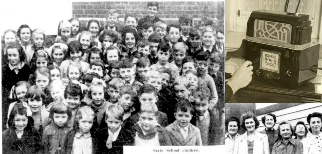
Weekly Times 1951 pictures of the pupils and Mothers' Club. 1950's AWA wireless receiver (top)