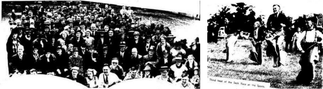
"Back to School" and "Sack Races" supplied by The Weekly Times (November 1937)